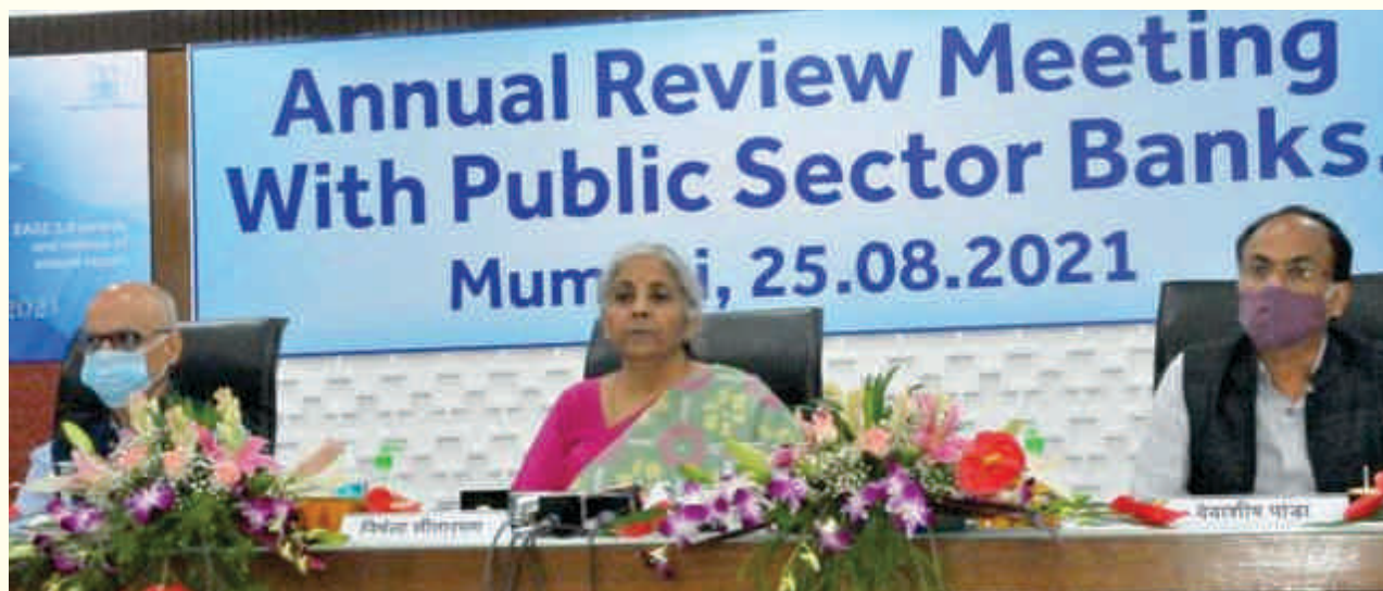
Debasish Pandey Secretary DFS announcing Family pension revision in the presence of Mrs Nirmala Sitaraman, Hon'ble Finance Minister

The immediate need at present is to have a minimum family pension to be fixed which will meet the basic needs of any family pensioner , while revising the current family pension entitlements. The bank employees union leaders must take up the case of enhancing minimum family pension with appropriate authorities to extend justice to the lowly paid family pensioners. The minimum entitlement of family pension in respect of Central government employees shall be reckoned while deciding the quantum of family pension to Bank employees.