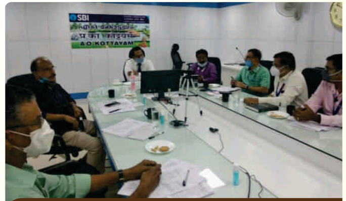
Structured Meeting at Kottayam AO was held on 2-9-2021 at 10.30 am