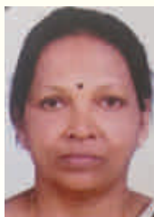
LM/6373 Valsamma MI Nettayam Thiruvananthapuram Expired on: July 17, 2021