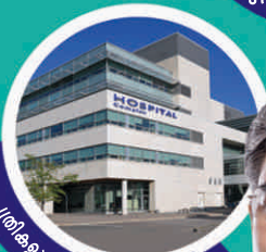
ആശുപത്രികളും നഴ്സിംഗ് ഹോമുകളും