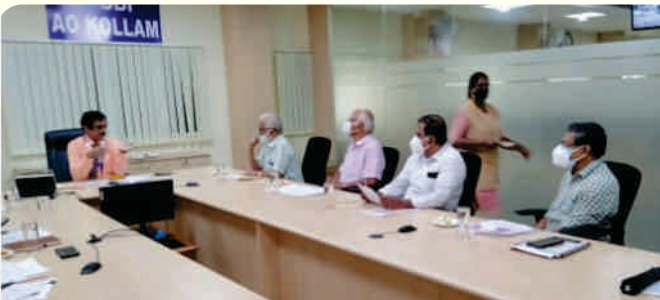
Structured meeting at Kollam AO was held on 26.08.2021