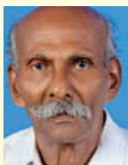
FPM/8028 Sukumaran A Kalpetta Wayanad Expired on: July 4, 2021