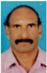
AFM/7344 Kakulstan V Kanhangad South Kasaragod Expired on: September 4, 2021