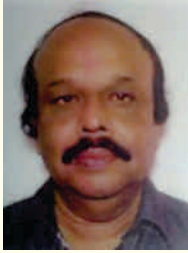
LM/701 Komaladas N Kunnathurmedu Palakkad Expired on: August 28, 2021