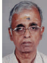
LM/811 Chidambaram TK Chalakudy Thrissur Expired on: September 26, 2021